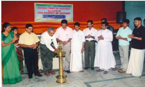
Workshop on Philosophy of History (21/07/2010)