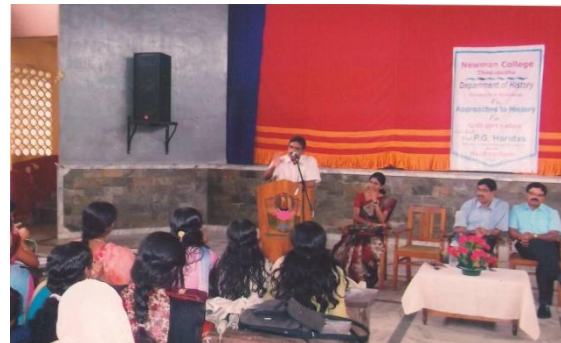
Seminar on Approaches to History (12/07/2011)